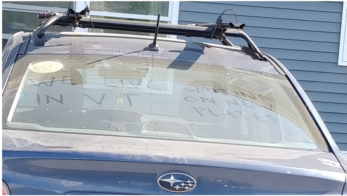
"We live in VT. Waiting on new plates."

It is understandable to want residents and visitors to adhere to the state's guidance regarding travel and quarantine. However, we enter dangerous territory when we make unfounded assumptions about people's intentions, behaviors, and character simply based on their presence in the state. These behaviors create fear among Vermont residents who worry about being targeted in similar ways.<sup>6</sup> The photo below, shot by the Director while passing by a neighbor's vehicle, is one example of that fear: