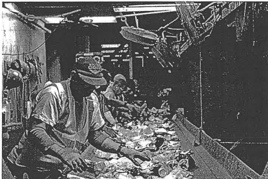
Employees of Casella Waste Systems sort recyclables at the Chittenden Solid Waste District's material recovery facility in Williston.

May 29 2019, 4:34 PM | no reader footnotes